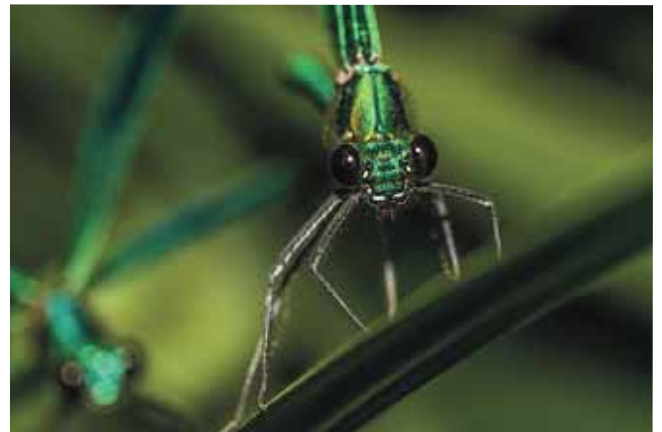
Banded Demoiselle

“We are only the trustees for those who come after us”