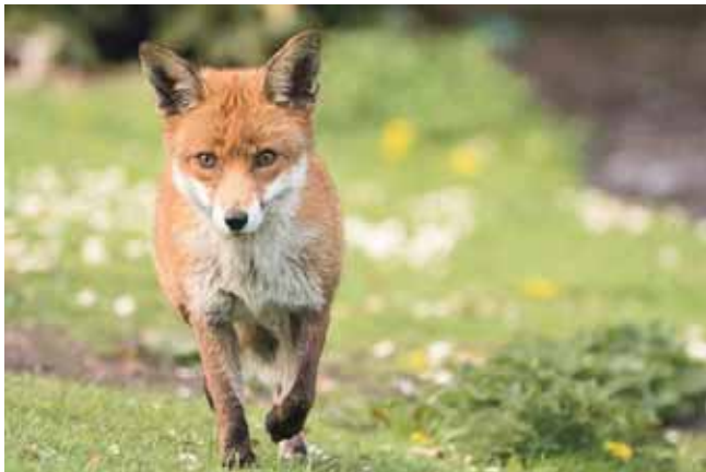
Carshalton Pond Fox by Ion Zaharia