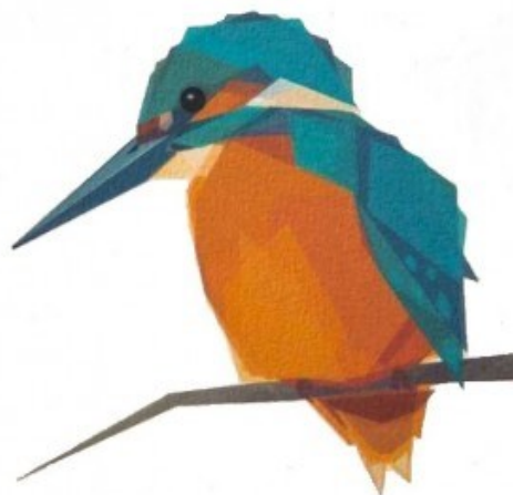
Look out for Project Kingfisher in your school