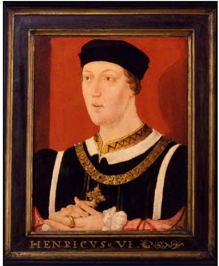
King Henry VI, artist unknown